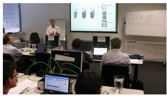
PROFINET training in Perth Western Australia