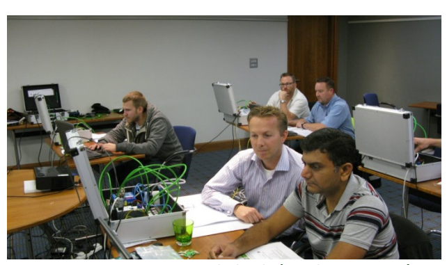
PROFINET training at Vanderlande (Heathrow Airport)

The Certified PROFINET Engineer course is an in-depth three-day course that is suitable for a wide range of engineers working in a wide variety of industries. The course is suitable for anyone who is working at a technical level in automation and control systems. Because this is an intensive course, we require attendees to be qualified up to Certified PROFINET Installer standard. However, don't worry if you are not qualified to this level: we always run the one-day installer course immediately before the engineer course so you can take both in a single week. We always send out preliminary material that covers this topic prior to the course.